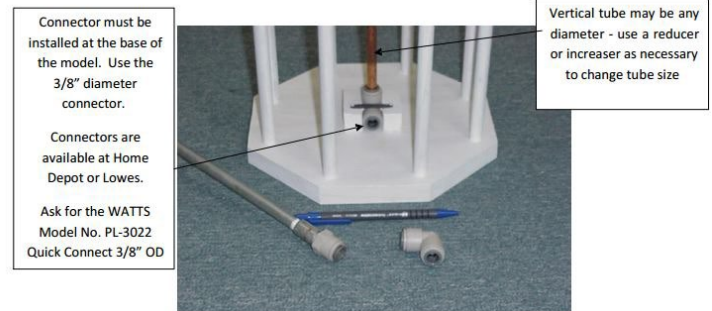
Figure 2: 3/8" Connector